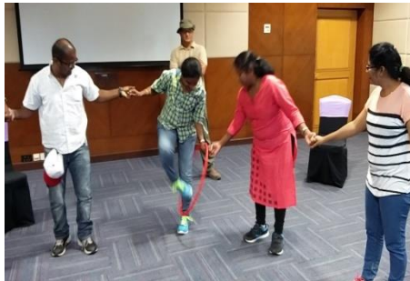
Fig: Hula Hoop Pass