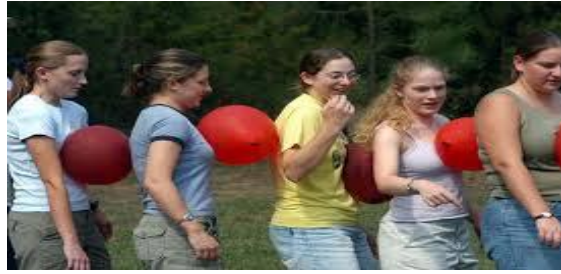
Fig: Balloon Relay