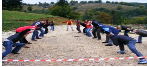
Fig: Longest Chain