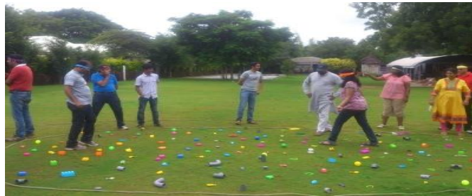
Fig: Blindfold Maze