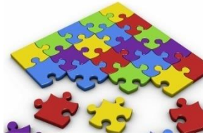
Fig: The Barter Puzzle