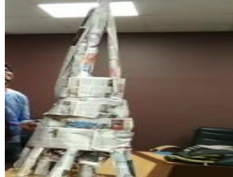
Fig: Newspaper Tower