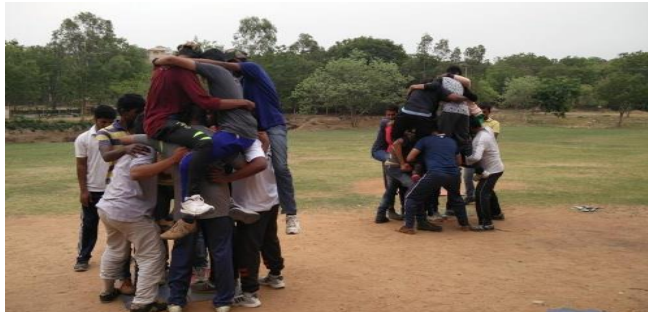
Fig: Magic Carpet