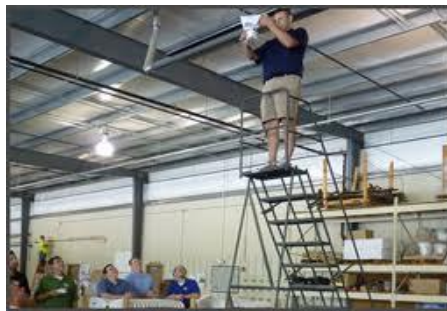
Fig: Egg Drop