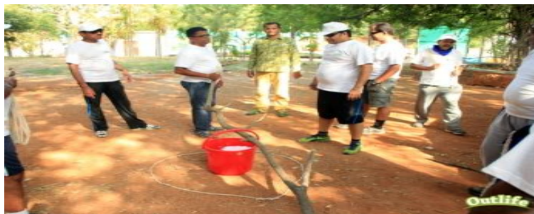
Fig: Atomic Waste